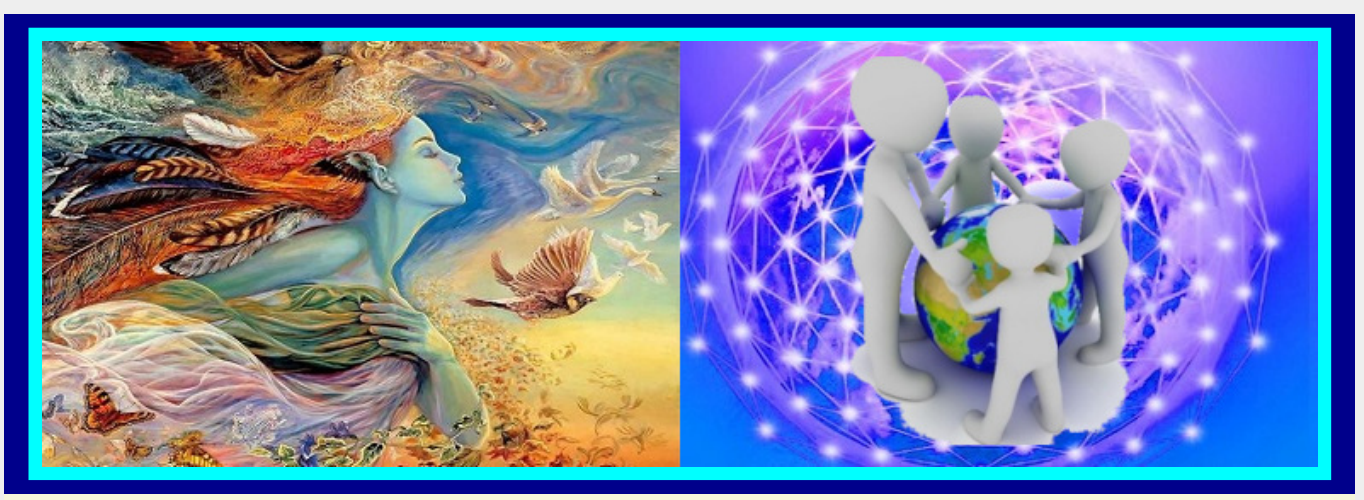
Working in Unity with Mother Earth Mother Earth via Pamela Kribbe - June 15, 2022 Published at Voyages of Light

www.BlissfulVisions.com June 16, 2022 - View in Browser